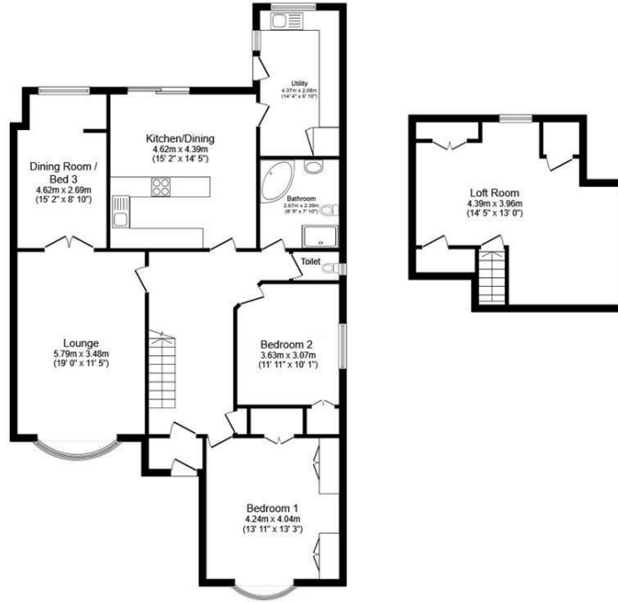
Ground Floor Floor area 125.3 sq.m. (1,349 sq.ft.)